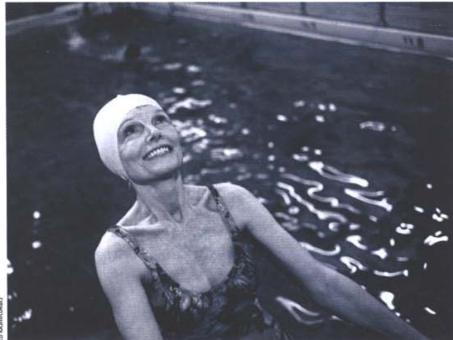
Physical exercise seems to protect the brain from insult and injury, though no one understands why

So it looks as though there are two ways in which people with a large cognitive reserve compensate for the effects of ageing or brain damage: either they recruit alternative