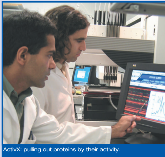
ActivX: pulling out proteins by their activity.