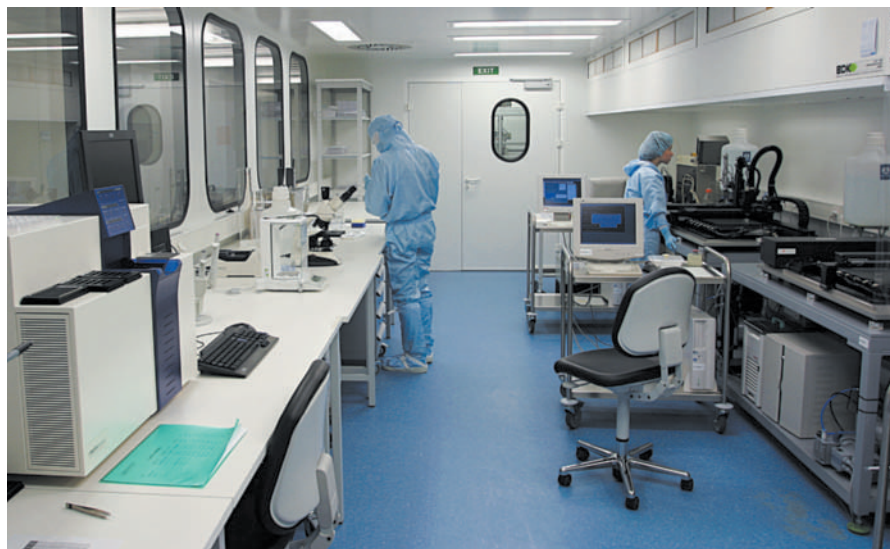
Zepatosens: microarrays must be made under rigorous clean-room conditions.

“We thought that after we had identified how many genes, how many proteins, the problem would go away,” says Celis. “But there are protein–protein interactions that give you different functions. Unless you